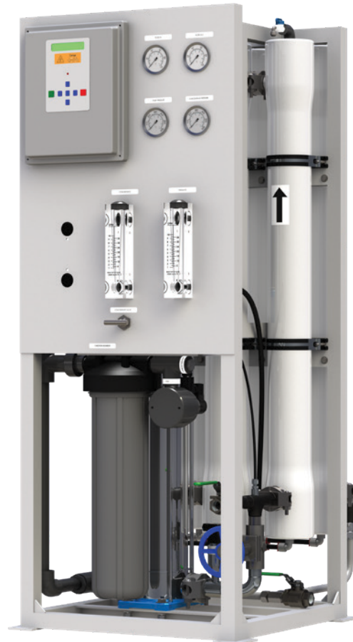
R2-6140 Reverse Osmosis System

Options available for the R2-Series include permeate divert, variable frequency drive, a chemical injection system and a clean-in-place system.