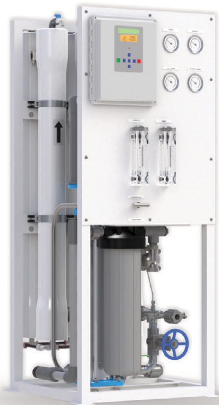
R2-6140 Reverse Osmosis System