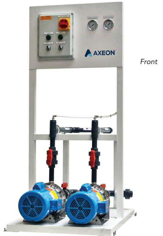
AXEON Repressurization Skid (Typical Design)

AXEON Repressurization Skids feature a compact mobile design which utilizes single or dual alternating pumps for continuous operation and inlet water pressure boosting. These units feature a white powder coated aluminum frame for corrosion resistance. Each system is pre-plumbed, pre-wired, assembled and quality tested for immediate online service and reduced installation and maintenance costs.